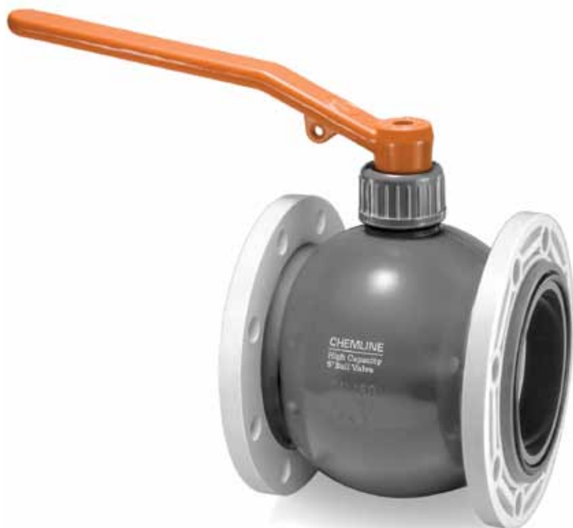
4" & 6" Sizes