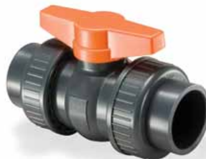
1/2" to 2" Sizes

Chemline SL Series Cavity Free Ball Valves are molded-in-place full port 1/2" to 6", available in PVC and PP with a polyethylene ball. The 6" size is a full port alternative to a 4" ball valve with ends increased to 6".