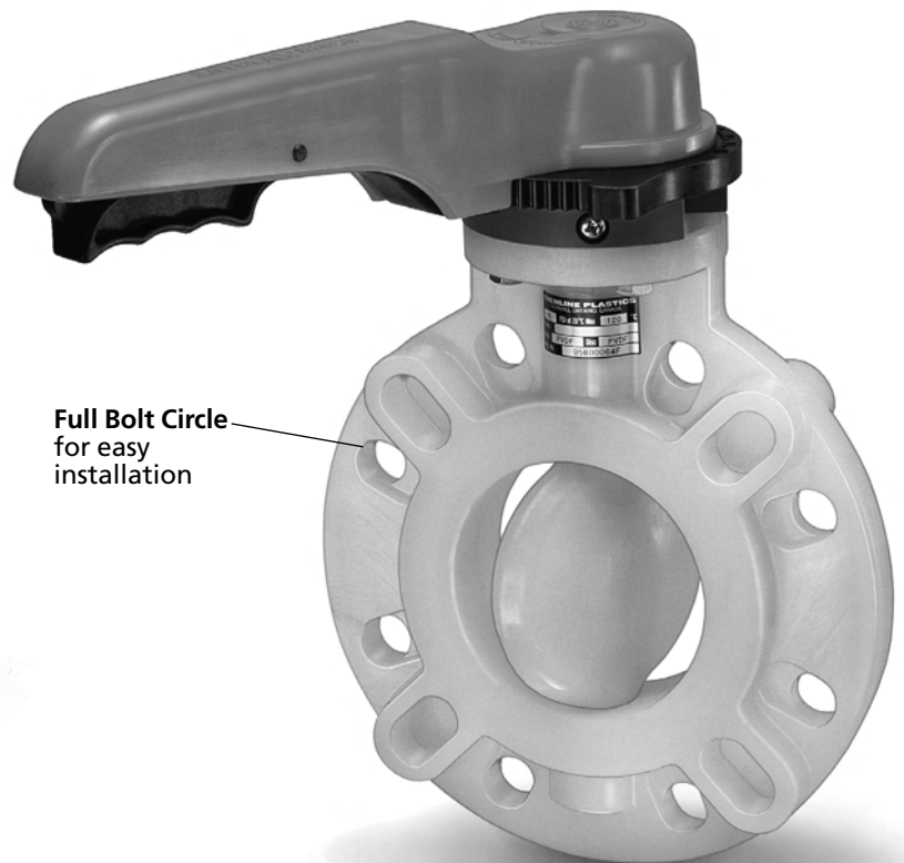
Full Bolt Circle for easy installation